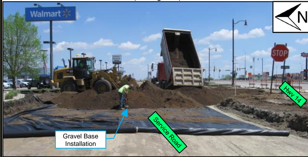
Project Photo: Project work @ service road @ north side of Hwy 14 (looking east)