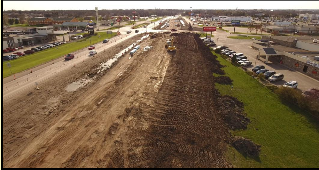
Project Photo: Bridge removals @ I-29 (looking west)